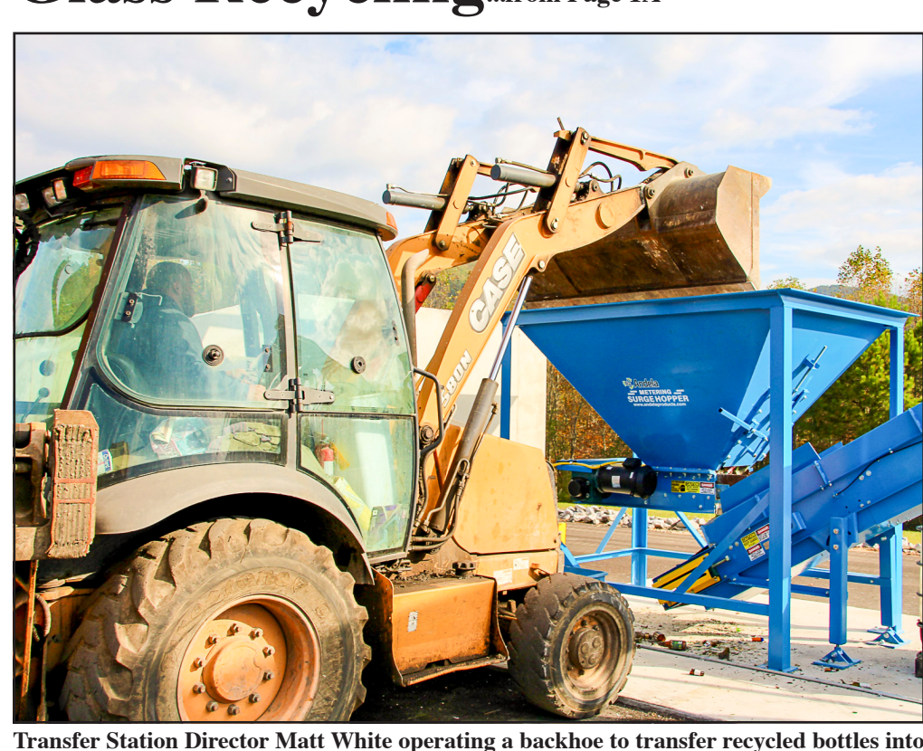
the "surge hopper" of the new glass pulverizing system.

the new glass recycling system, which has been up and running at the Transfer Station since the beginning of the month.