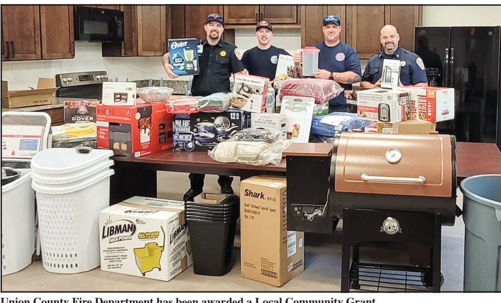
Union County Fire Department has been awarded a Local Community Grant Union County Fire De- is located on Hwy 129 North,

partment has been awarded a Local Community Grant from Walmart in the amount of $3,500.