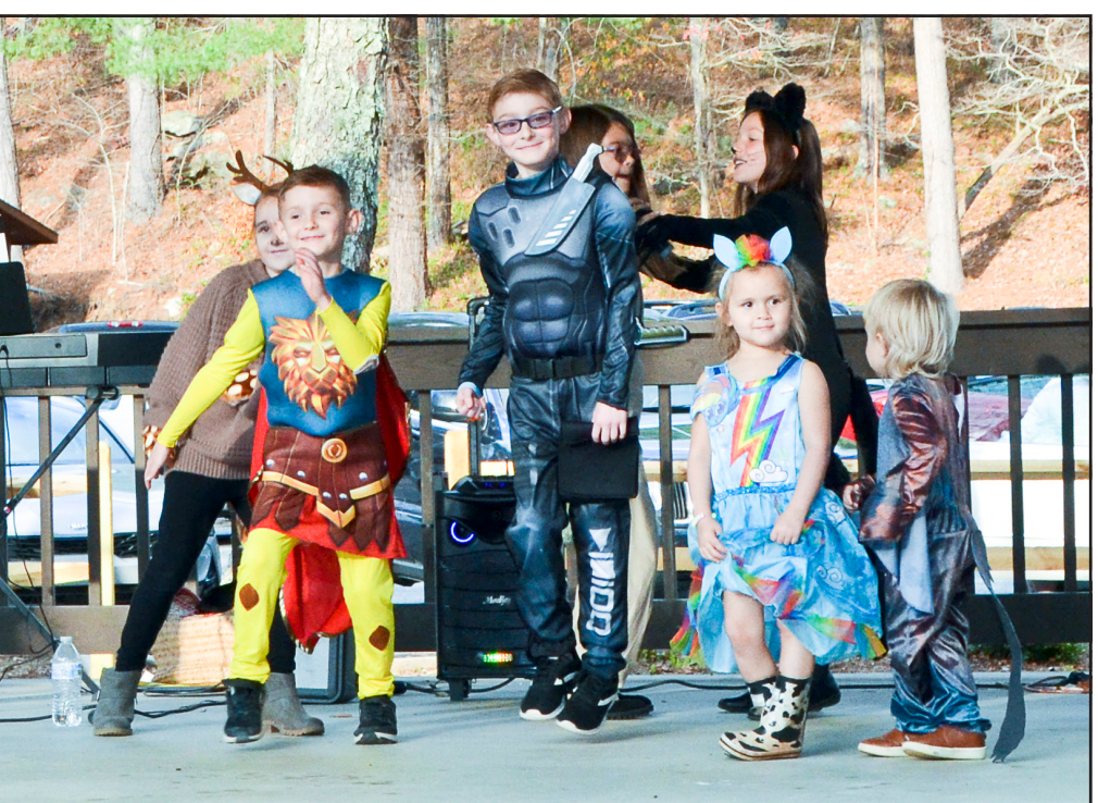
Like last year, the Blairsville Boo Bash at Meeks Park will be hosting a Halloween costume contest for youngsters.